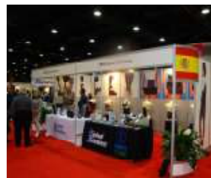
Imágenes de la delegación española durante el Congreso de AOPA.