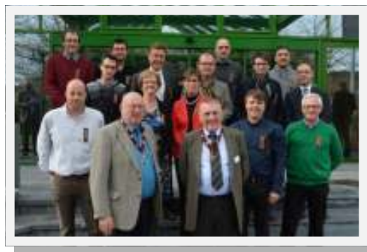
Laureates with the Board members.

enced people: "They are a wealth for our society which is more than ever in need for such skills, enthusiasm and motivation". The President described receiving this honorary award as recognition of the intense dedication with which the laureates practice their profession.